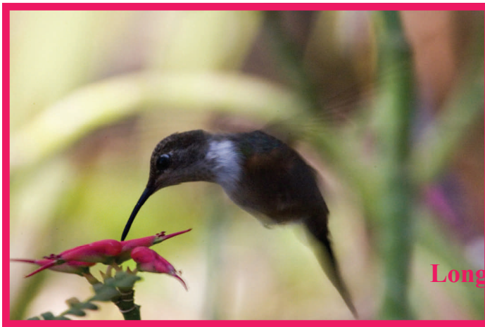
Long Island Hummingbird